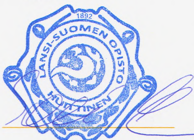
Sami Malinen Principal of West Finland College