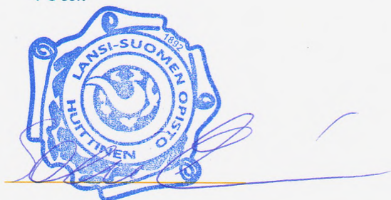
Sami Malinen Principal of West Finland College